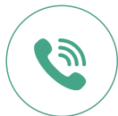
4 simultaneous calls