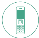
1.8" 128x160-pixel LCD