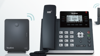
W41P DECT Desk Phone

The Yealink DECT IP phone solution enhances communication productivity and flexibility for on-the-move employees in various business segments. The new Yealink DECT desk phone W41P is a package of T41S, W60B and DECT dongle DD10K; it offers delightful user interface and exceptional HD voice quality besides the ease of deployment that reduces IT department workload. It's time to equip your office with Yealink's scalable, feature-rich and HD DECT IP phone solution and enjoy absolute flexibility in your business communication.