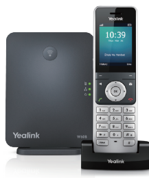
W60P Wireless DECT IP Phone