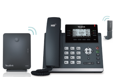
W41P DECT Desk Phone