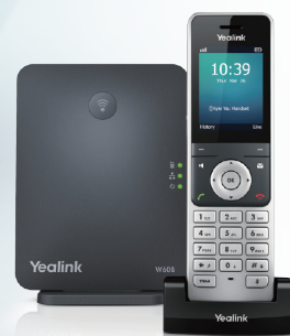
W60P Wireless DECT IP Phone