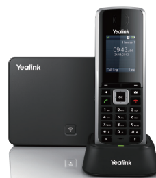
W52P Wireless DECT IP Phone