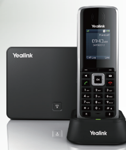
W52P Wireless DECT IP Phone